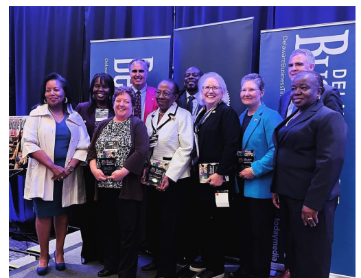
2023 Mitchell Awards Honorees.