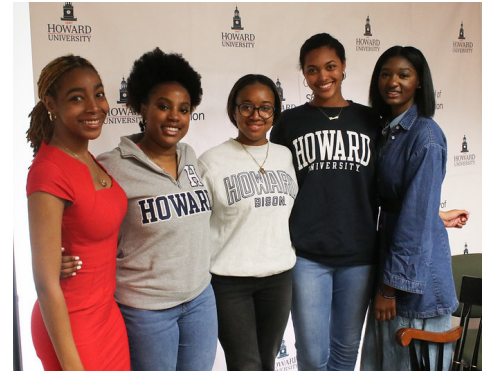
GYO Students attending Leadership Conference at Howard University's School of Education